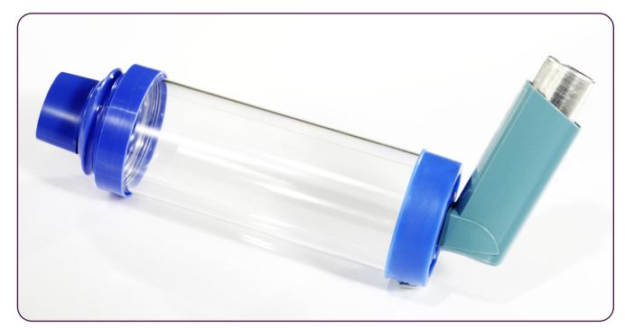
Example of a metered-dose inhaler with a spacer