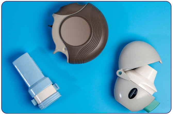
Examples of dry powder inhalers